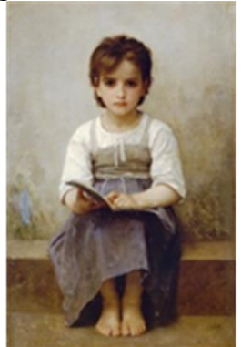
The Hard Lesson