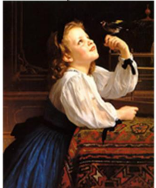
Tête d'Etude l'Oiseau