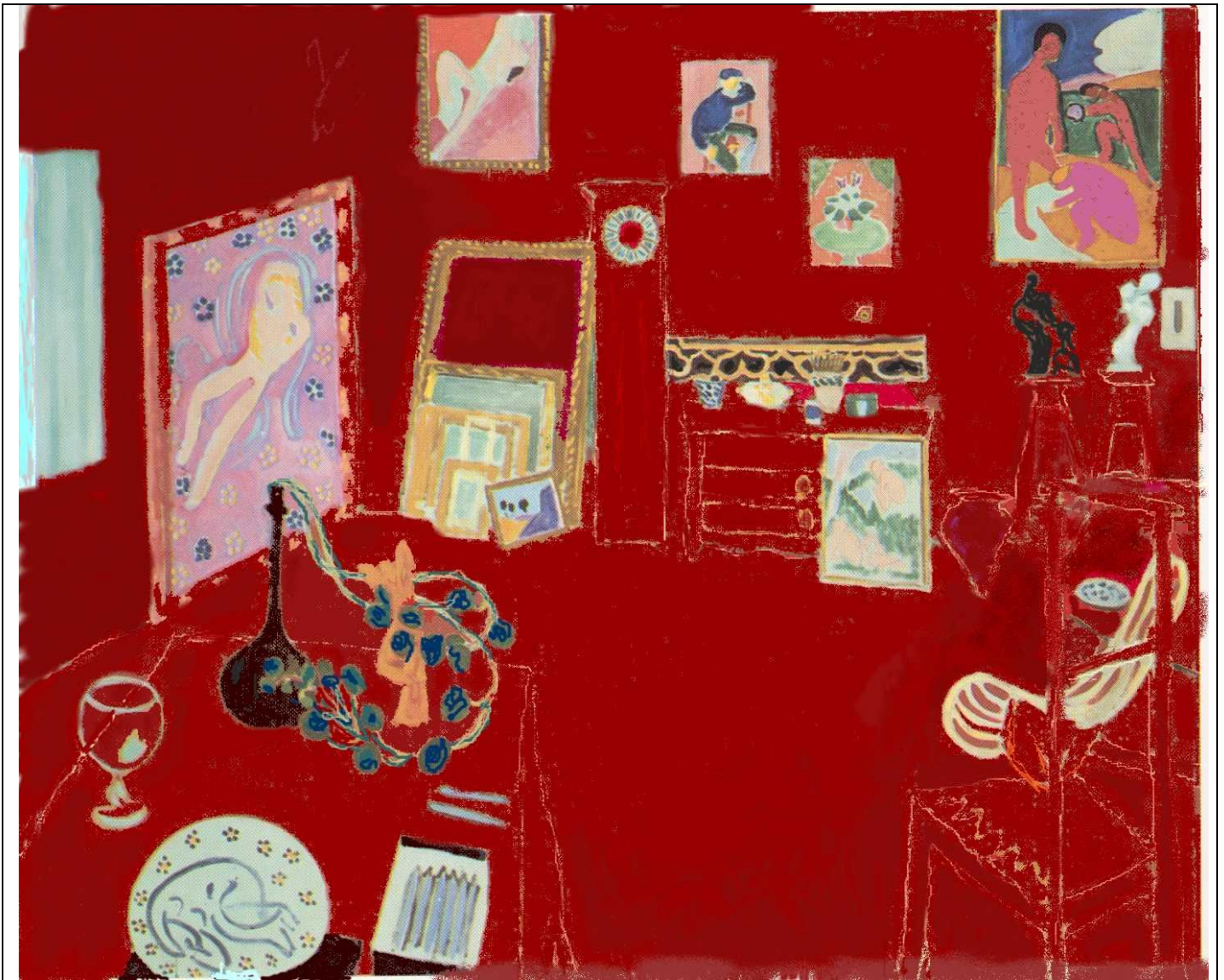
Henri Matisse The Red Studio , 1911

"I don't paint things. I only paint the difference between things."