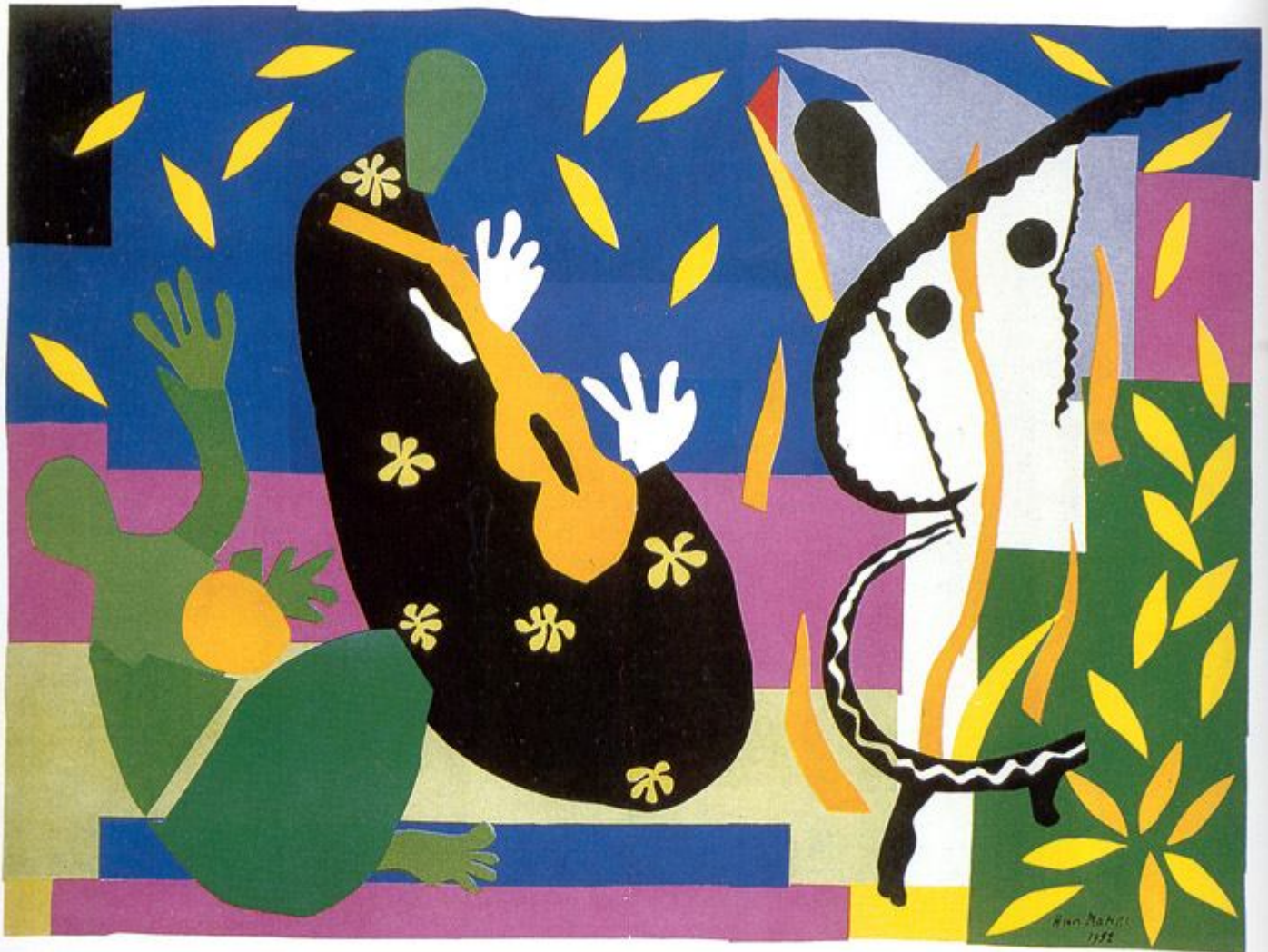
Henri Matisse, King's Sadness , 1952

"Drawing is like making an expressive gesture with the advantage of permanence."