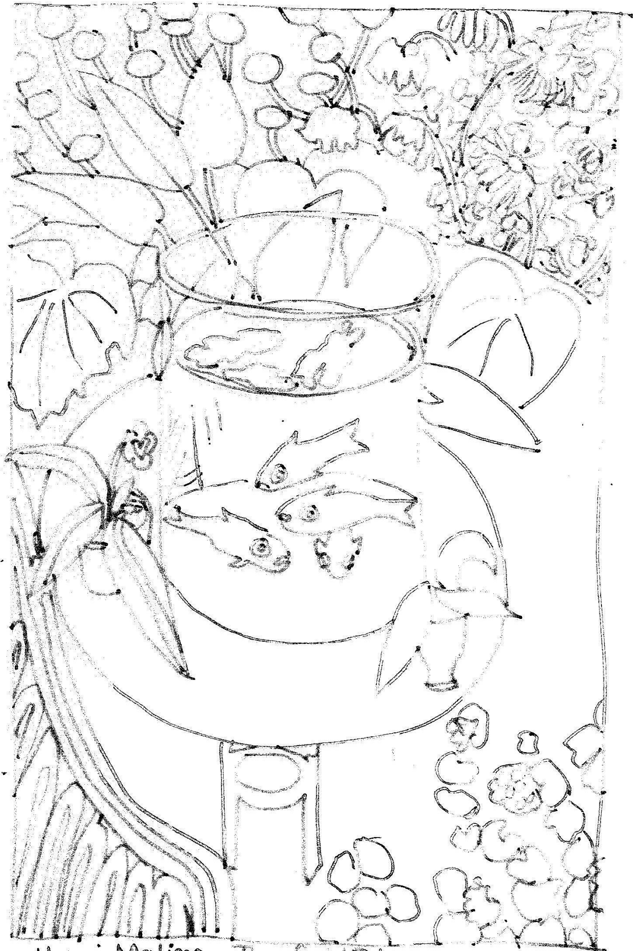
Henri Matisse The Goldfish